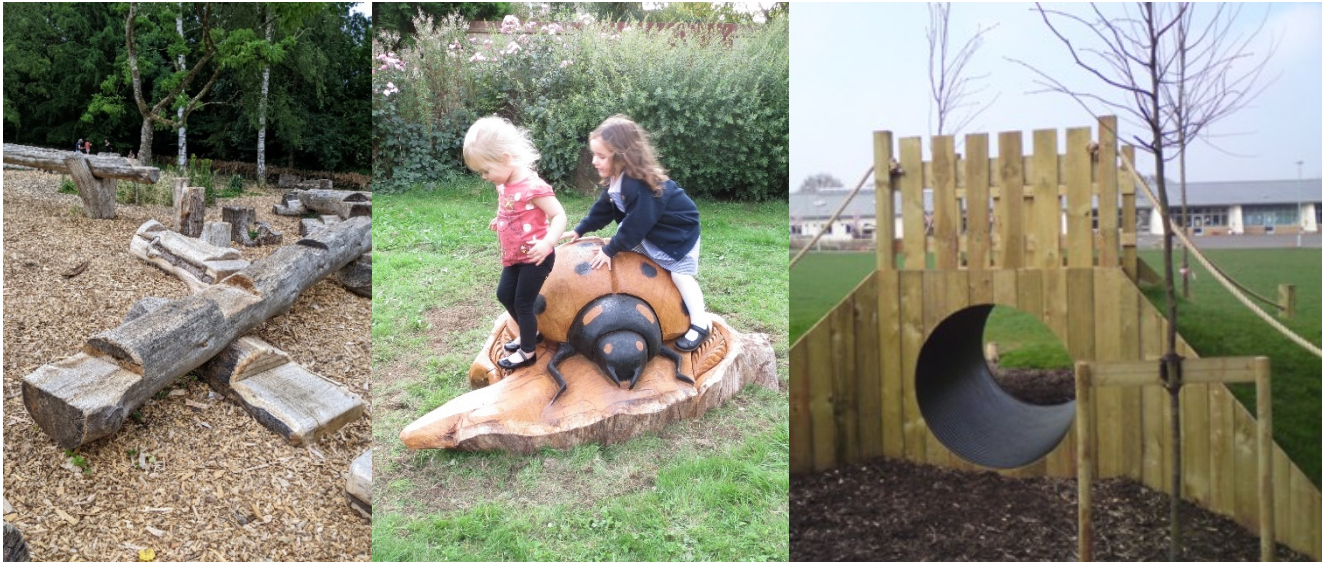
Figure 1. (left) Collection of logs and stumps at Dyffryn Gardens (Alice Jones), (centre) sawn landscape feature, and (right) ditch and mound system with tunnel (Jane Bain) (CC BY-ND 2.0).

4.1.10. It is important to examine the intended location to identify any existing elements which may provide chances for play (e.g. trees, natural earth formations, slopes). The design and layout of a path through an area can become a play opportunity (e.g., within a grassed area, a mown meandering path can form a maze for smaller children, while trees and bushes with fallen branches/twigs can provide possibilities for den making).